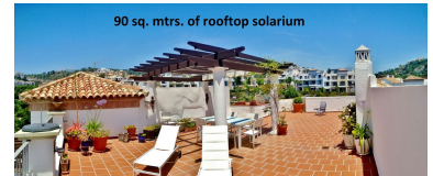
90 sq. mtrs. of rooftop solarium