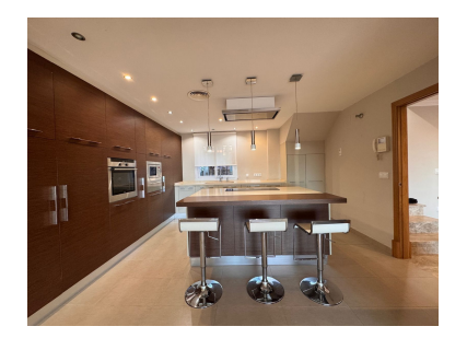
Price: 849,000 € Printing day : 15th May 2025

M<sup>2</sup>: 170 Parking places: by request