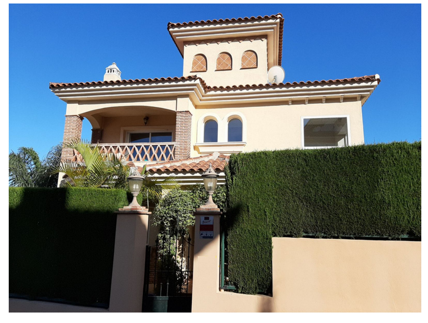
Bedrooms: 4 Status: Sale