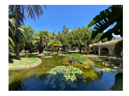
Price: 2,750,000 € Printing day : 25th August 2025

M<sup>2</sup>: 350 Parking places: by request